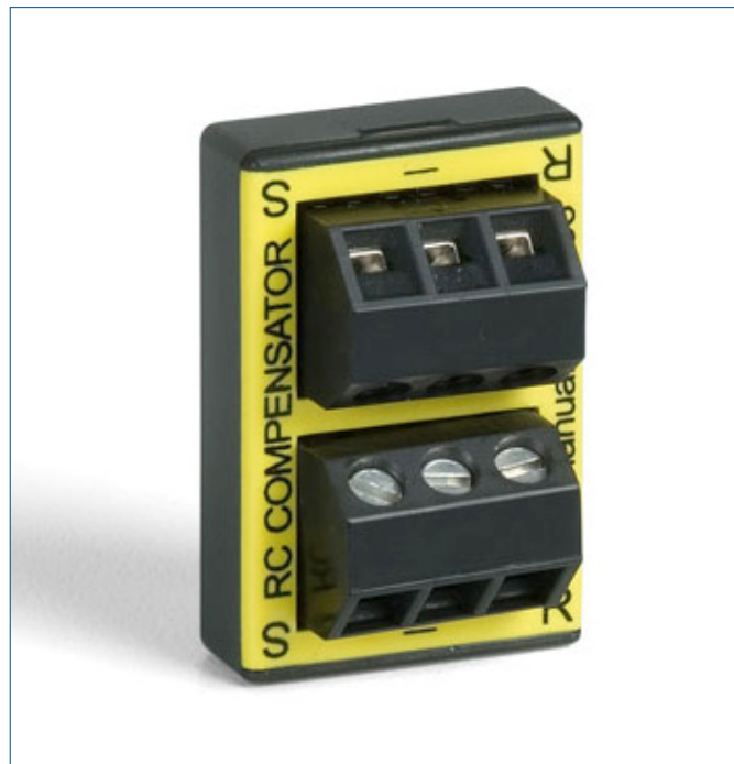
RC Compensator Module.