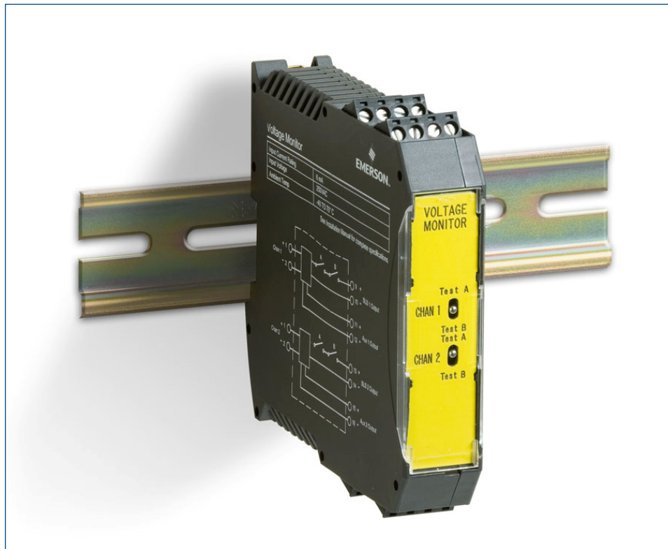
SIS Voltage Monitor.