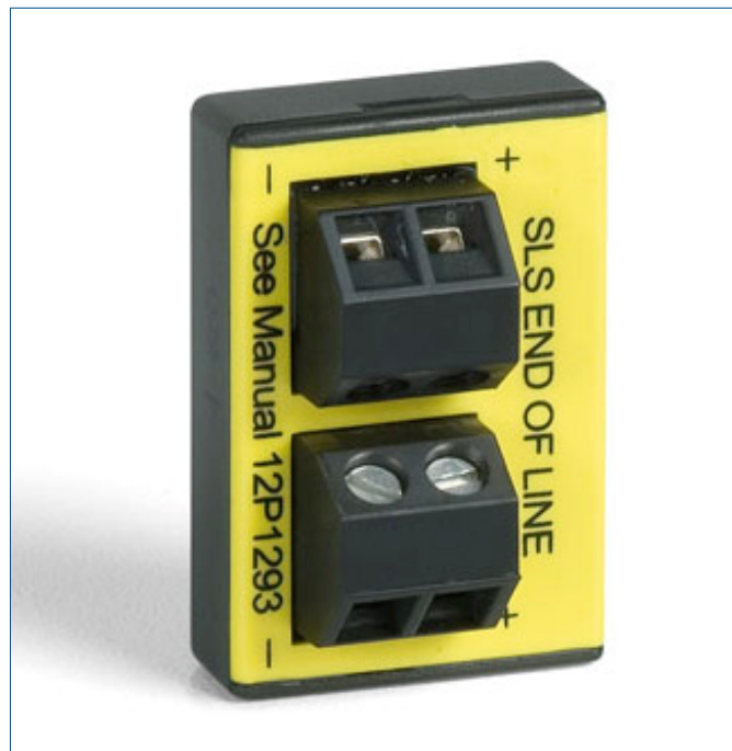
End of Line Resistance Module.