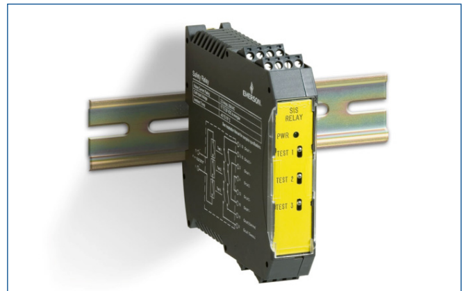
SIS Relay Module.

A relay coil is energized for all three relays in normal operation. If a demand occurs, the SLS removes the power from the coil for all three relays at the same time. Each relay can be proof-tested in the field.